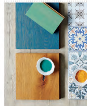
MATERIAL MAGIC Mix & Match Finishes