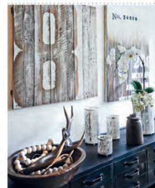
DRESS UP Easy decoration tips from stylists