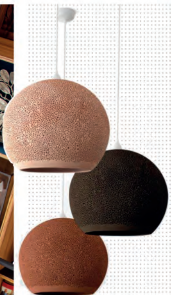
THE CUT Furniture & Fittings

34 TOP INTERIOR DESIGN FIRMS +182 pages of inspirational spaces