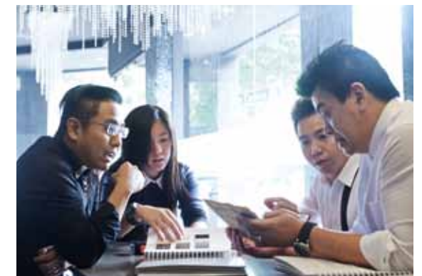
Expect big changes for Rhiss Interior in 2015 as the design firm moves into a new showroom and bolsters its ranks with new designers