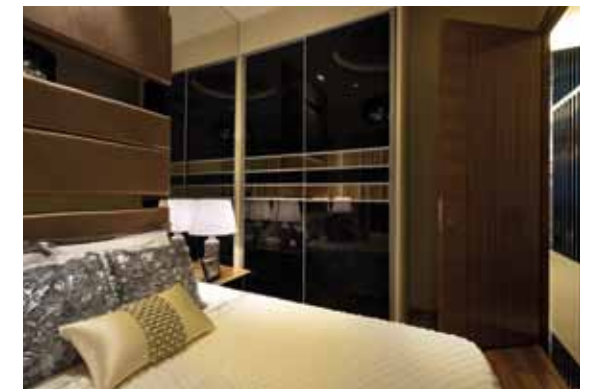
Dark hues, soft textures and warm interiors are the calling cards of Rhiss Interior’s flair for dramatic yet romantic interiors.

“We’ve been around for almost nine years, so it’s time for us to take a more matured approach to design. We want to bring in new elements and we’re exploring new ways to express our creativity,” Wincy offers. The boutique design firm has a brand new showroom at Serangoon Road and hopes that its new design direction will appeal to a new generation of younger homeowners. But with all the changes planned out for 2015, Rhiss Interior still believes in the factors that have contributed to its success. “Our designs are always personal,” Wincy reveals, “and the homes we design actually look like homes and not showflats. That’s the secret to our designs... to put it simply, it’s that personal touch that no one else can replicate.”