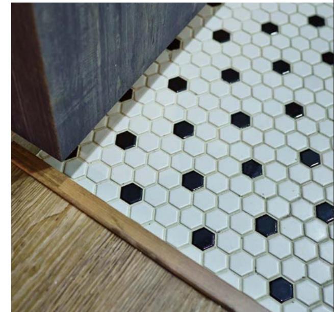
(Left) Rhiss Interior places utmost importance in materials selection, as seen in its varied portfolio.