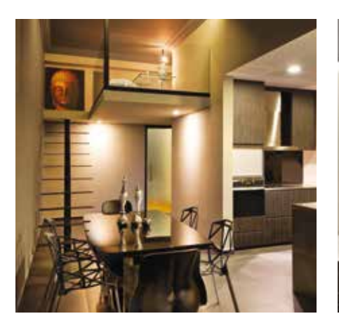
EARLIER WORKS Before the industrial style fully caught on, Rhiss Interior was already experimenting with elements of it, as can be seen in this private apartment.