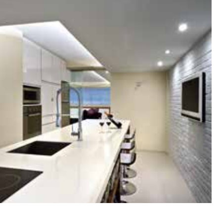
NATURAL BEAUTY An on-going theme in Rhiss Interior's design direction is natural beauty, where an organic material palette and an openness to natural sunlight takes centrestage.