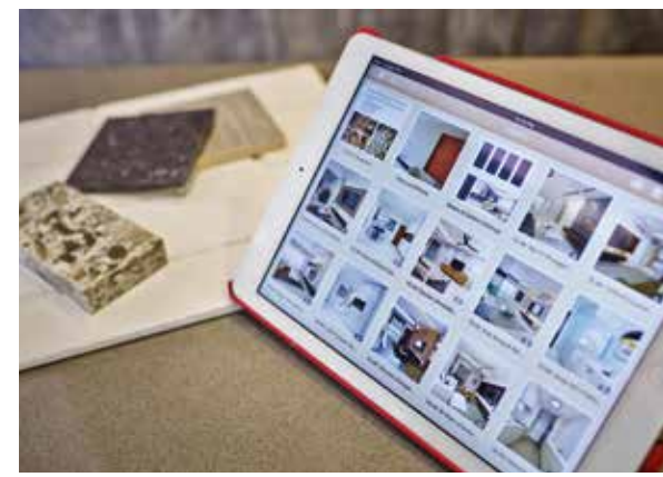
PORTFOLIO Rhiss Interior has a varied portfolio of designs, with each project showcasing a unique personality and bespoke identity.

DESIGN MANTRA "WE STRIVE TO USE THE BEST MATERIALS FOR OUR CUSTOMERS AND GIVE THE HOME A PERSONAL TOUCH."