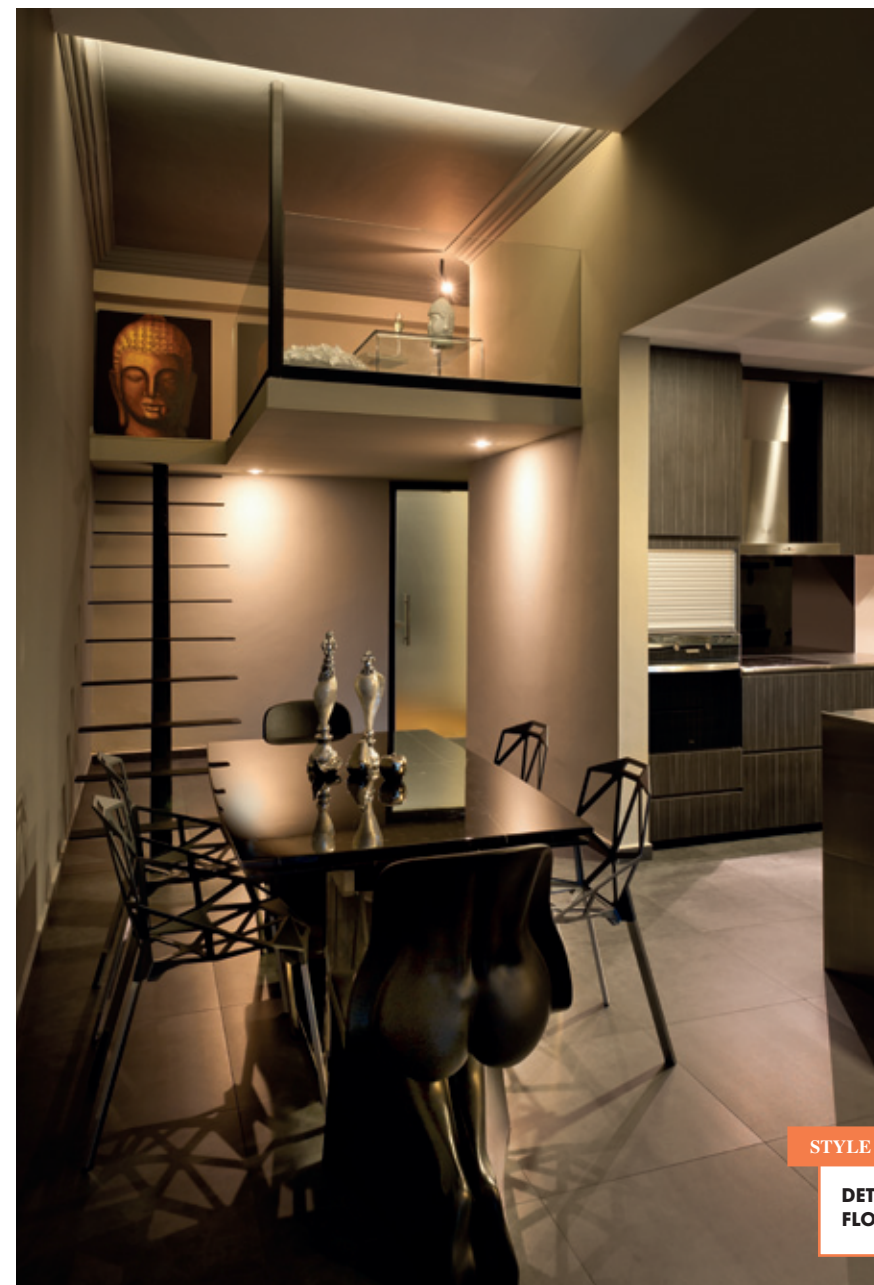
STYLE FILE 3 DETAILS 2-bedroom Apartment FLOOR AREA 1,098 SQFT