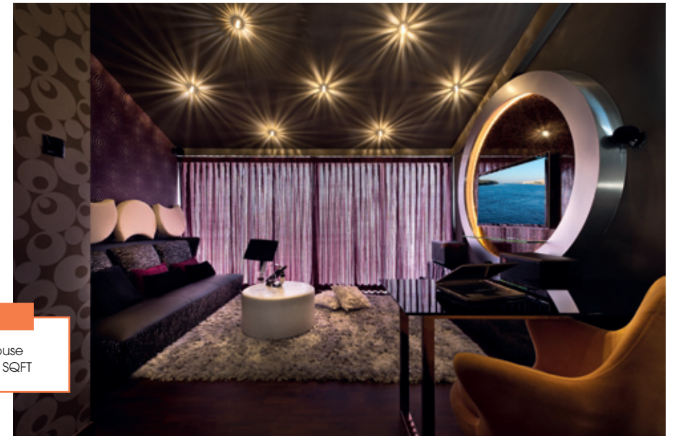
STYLE FILE 1 DETAILS Terrace House FLOOR AREA 3,500 SQFT

CREDITS: Bianco Marble Uassiq (DXO4316G) laminate, from Lamifak; Blue Armagos (LE18245) laminate, from Lam Chuuan; Bend Bunny lounge chair from Pomelo Home.